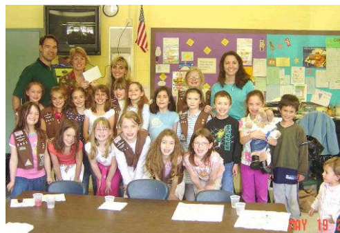
Windham NH Brownie Troop 2653 Golden Brook art room hosts troop donation