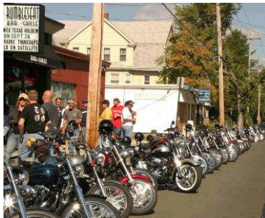
1 st Annual Poker Run Sponsored by: Rumbleseat