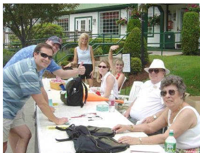
3 rd Annual DNH Golf Classic At The Sheraton-Ferncroft Country Club