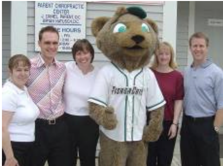
2005 Kid's Day America Parent Chiropractic Staff and Fungo