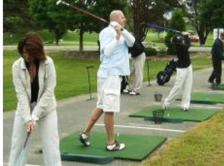
4 th Annual DNH Golf Tournament Golfers drive to raise $11,000 for DNH